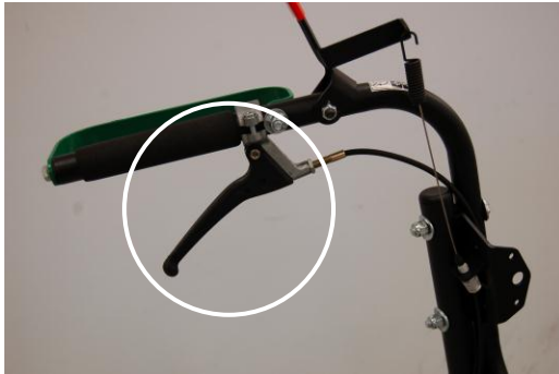
Reverse Drive Lever (left hand)