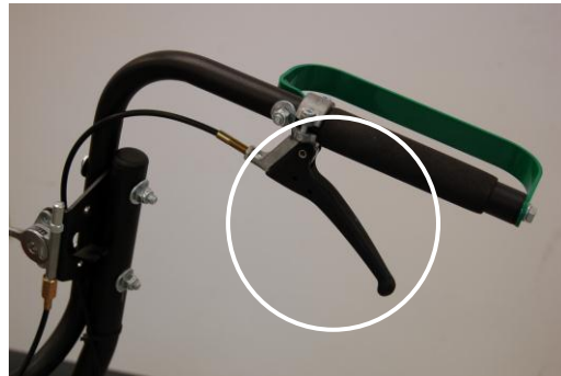
Forward Drive Lever (right hand)