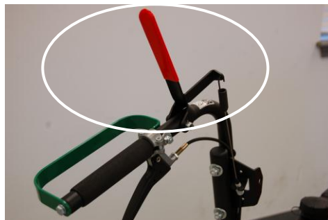
Blade Clutch Lever